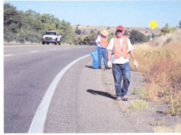
We are hard at work