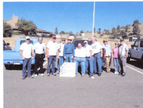
Yeah, we are done!