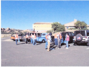
Eager & ready to start